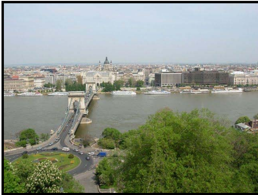
Panoramic View of Budapest