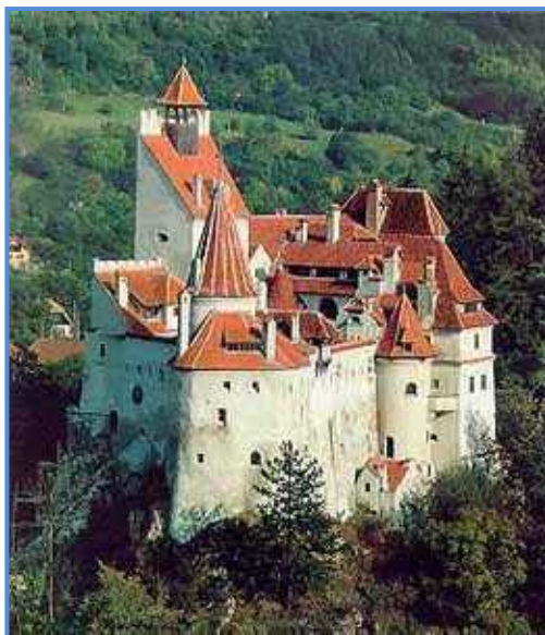
Bran ("Dracula's") Castle