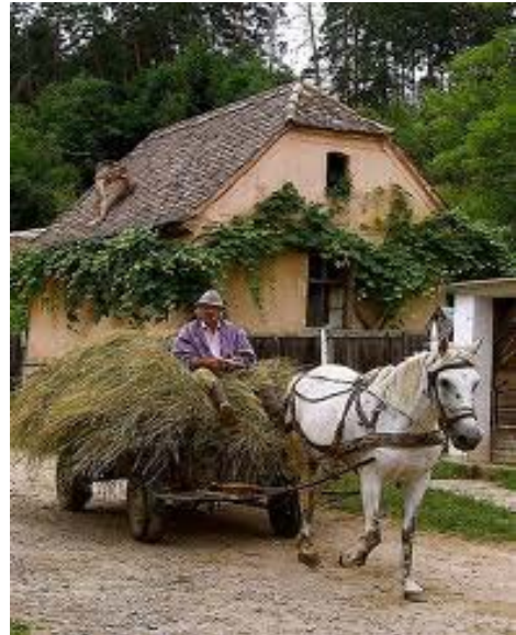
Horse cart, Transylvania, Romania